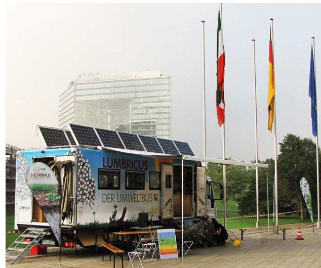
Environment bus LUMBRICUS 2016

Since 25 years the rolling classroom and outdoor laboratory LUMBRICUS and its team has led more than 80.000 students to a deeper understanding of natural processes and ecological circumstances. Presenting information on regional environmental issues and the way of participative lessons. Children become adults: meanwhile teachers return with classes having profited themselves as kids or students from the practical experiences with LUMBRICUS, an example for a long lasting effect of sustainable development.