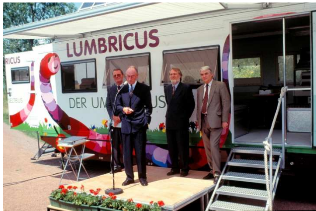
Official handover of LUMBRICUS June 1992

Being started 1992 „LUMBRICUS – the environment bus“ supports school classes and adult groups in outdoor lessons on ecosystems and environmental hazards. Meanwhile based on two 7,5ton trucks LUMBRICUS provides right at the places of interest attractive possibilities for information and hands-on studies f. i. of biological or chemical questions.